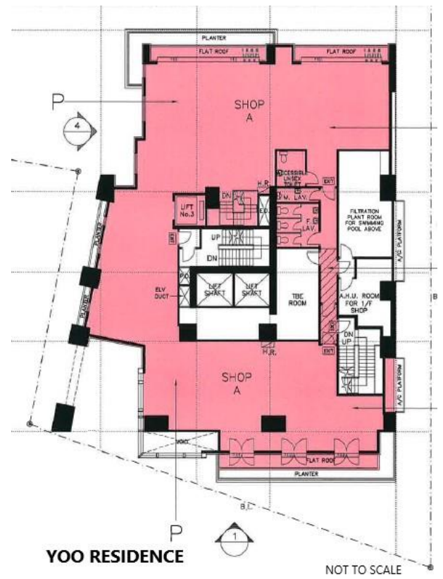
YOO RESIDENCE FIRST FLOOR PLAN NOT TO SCALE FOR REFERENCE ONLY